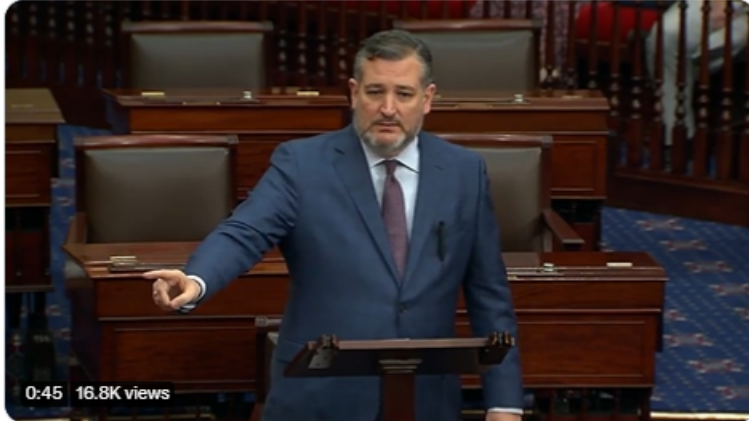
9:38 AM · Mar 31, 2023 · 41.1K Views

It's a shame Senate Democrats refuse to pass my school safety legislation.